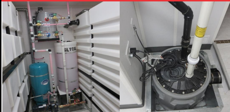
Heavy Duty Grinder Pump